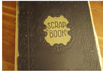
Photo frames and digital converters were hot items this past holiday season. Photo storage has really evolved from the cardboard box. If 2009 is your year to work on your photos, please be sure to strongly think how you want your photos preserved. Preserving your photos will keep your memories lasting forever.